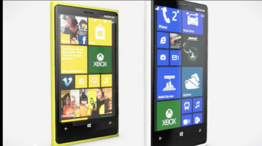
Product film showing off the beauty of the product.